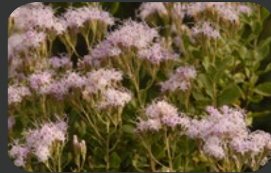
Garberia: a threatened plant on Lake Grassy